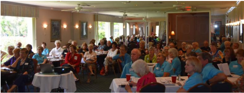
A full house for the All Florida Conference - 64 participants!

Twenty-six of us outdid ourselves in welcoming the Florida clubs and sponsoring a fabulous All Florida Conference. We received excellent feedback and it was a wonderful opportunity for us to see the "big picture" of Friendship Force International and discuss common issues.