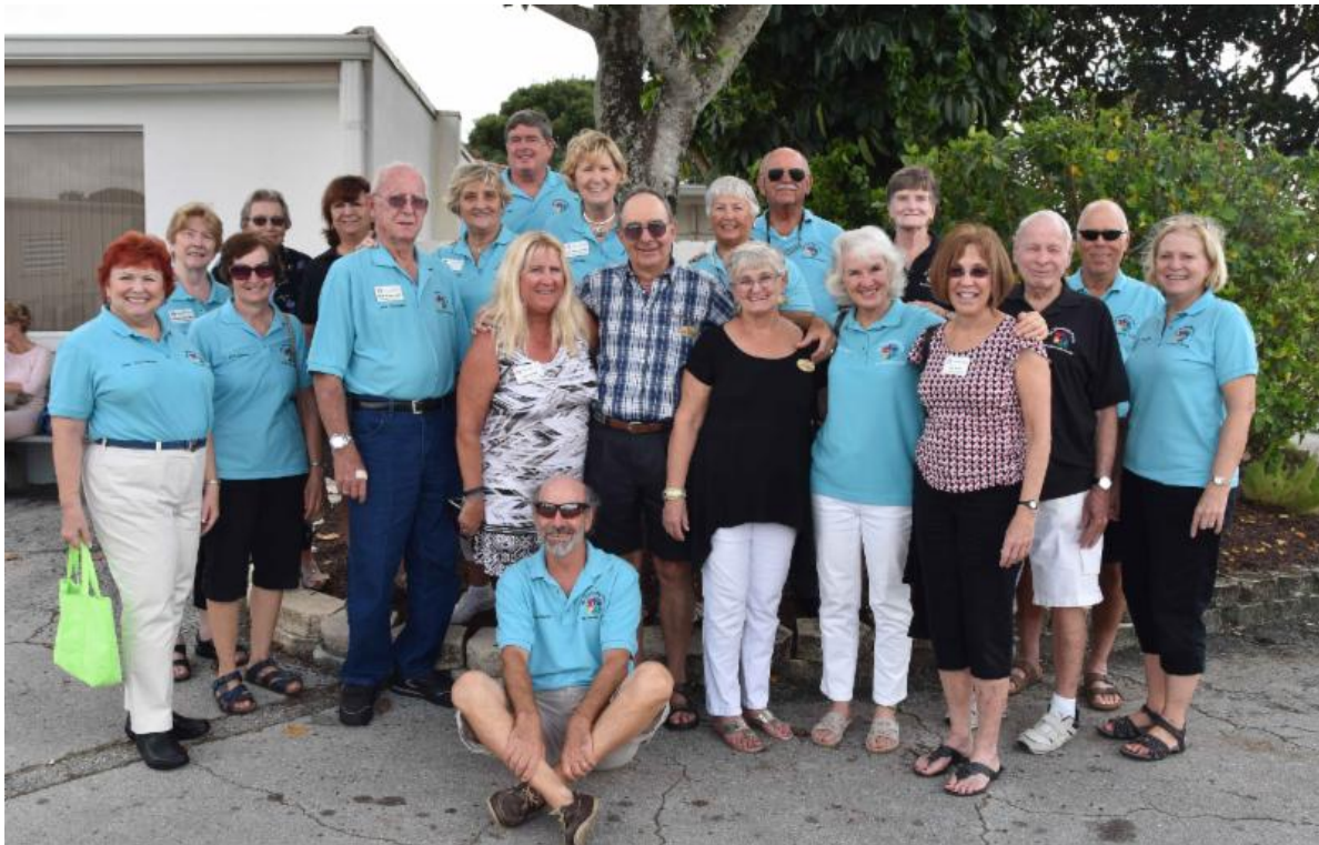
A great turnout and support from our club at the All Florida Conference!