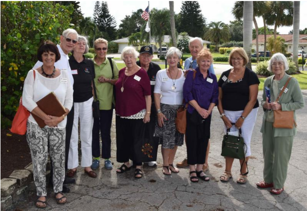
Florida Suncoast (Tampa area) club representatives - They get to do it next year!