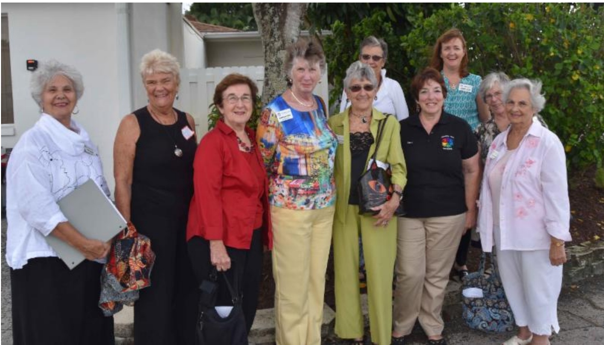
Sarasota Club representatives - closest to us geographically