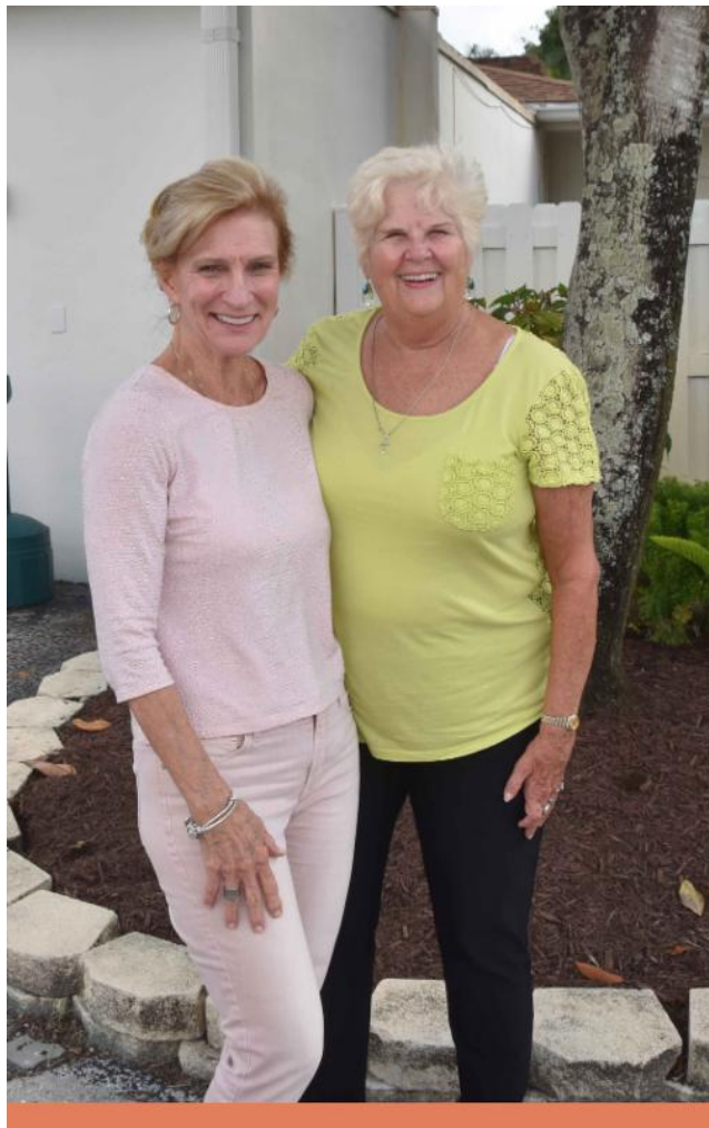
Tallahassee/Ollie/FSU club reps