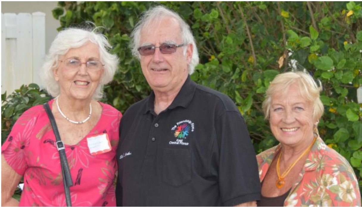
East Central Florida (New Smyrna Beach area) club reps