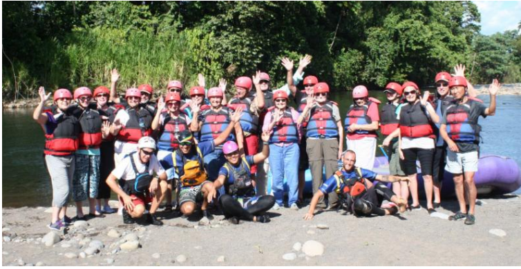
Rafting the white water of Costa Rica