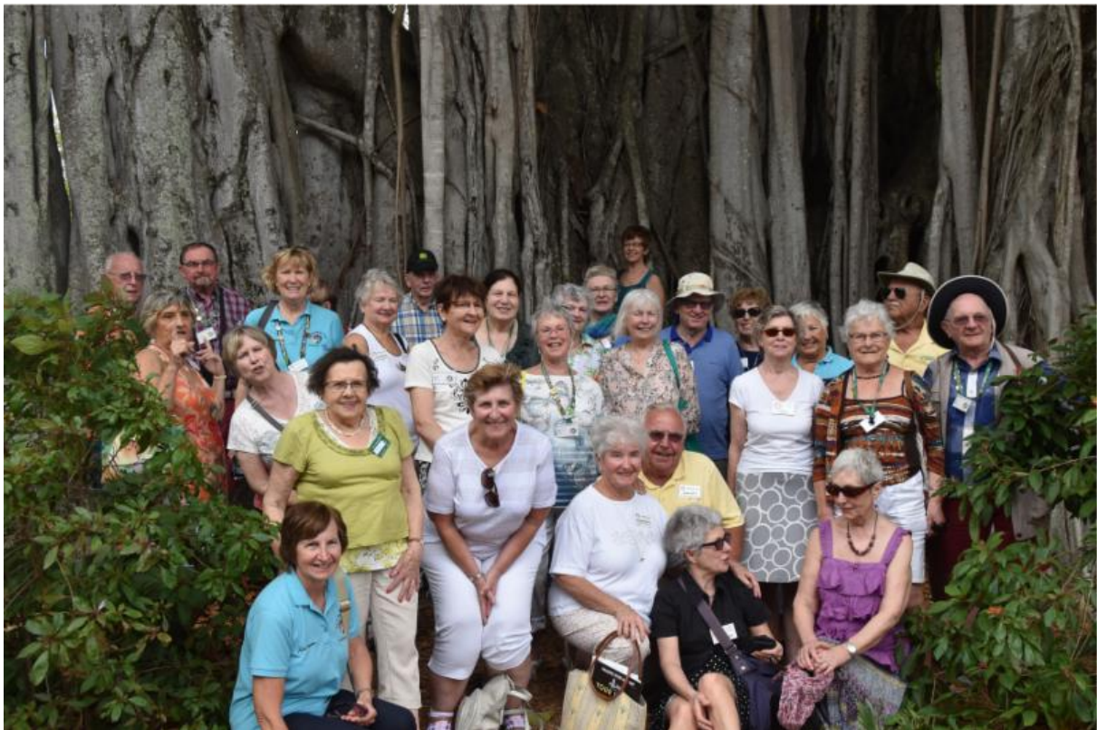
Our club poses with the Belgians under a Banyan Tree