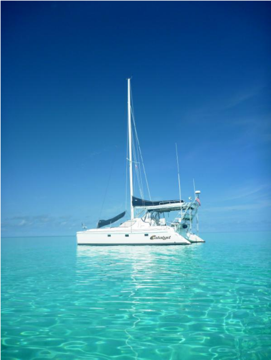
s/v Catalyst at anchor in the gorgeous Bahama waters