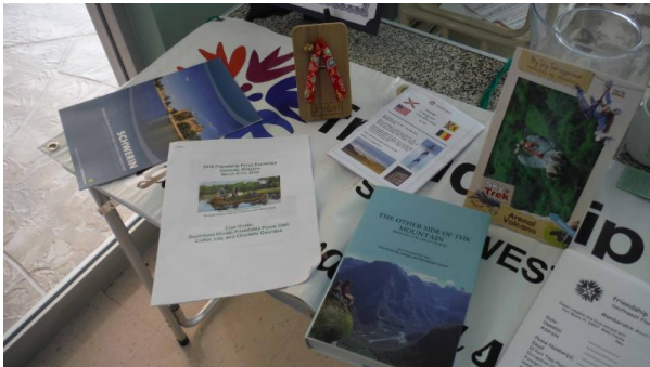
Table showing some of our club mementos