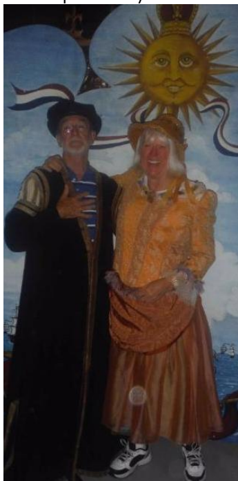
Do you recognize these people?