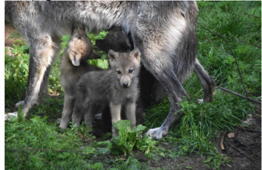
Mama feeds her baby wolves

incorporated a visit to the Wolf Center where we saw baby wolves nursing (many of our Canadian friends had never seen this. Quite lucky for us!) Subsequently, we had a lovely tour and lunch at Abbey Gardens, Tour of Haliburton Wind & Solar company and their Brewery and Tasting. On Tuesday, we toured the town and had a rousing Farewell Dinner at Peppermill Restaurant. As with Stratford/St Mary's, it was difficult to say goodbye to these great Canadians!