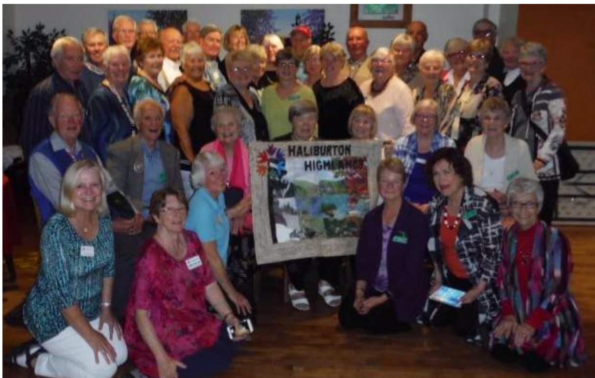
Here we are with the Haliburton Club at the Farewell Dinner