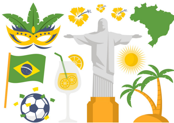
Symbols of Brazil