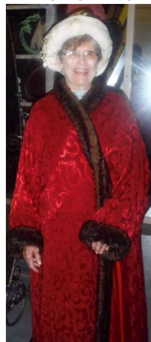
"Lady in Red" Warehouse Tour

The Haliburton Club seemed to be very active (about 50 in the club) and most of them were there to welcome us. On Friday, we went geo-caching at Kinark's Outdoor Center and were hosted at family-like dinners by club members. Saturday's agenda