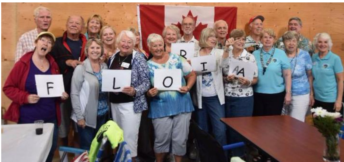
At Stratford St Mary's Farewell Party, we educate Canadians about Florida