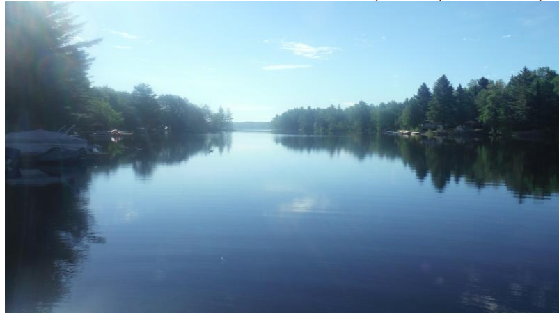
Morning has broken on a Haliburton Lake - simply gorgeous!