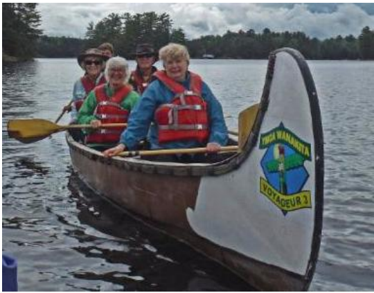
We test out the Voyageur Canoes on the lake

incorporated a visit to the Wolf Center where we saw baby wolves nursing (many of our Canadian friends had never seen this. Quite lucky for us!) Subsequently, we had a lovely tour and lunch at Abbey Gardens, Tour of Haliburton Wind & Solar company and their Brewery and Tasting. On Tuesday, we toured the town and had a rousing Farewell Dinner at Peppermill Restaurant. As with Stratford/St Mary's, it was difficult to say goodbye to these great Canadians!