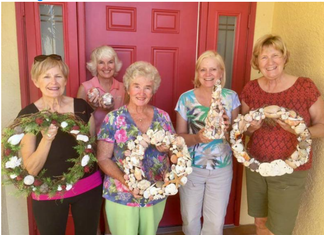
Friendship Force shell girls displaying their creations