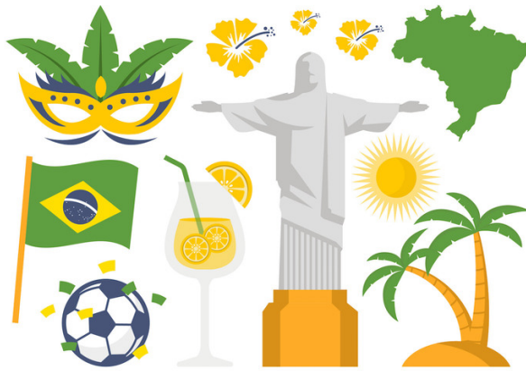
Images of Brazil

We'll be leaving the day after our April meeting on Saturday, April 7, on our club's journey to Brazil!