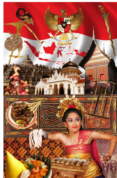
Images of Indonesia

Malang is the second largest city in East Java and is a popular tourist destination. Click on Malang FF to discover more fascinating info about this club of 40 that was founded in 1997 and who has welcomed many FF clubs throughout the world. Banjarmasin is known as a River City because it is located at the junction of the Barito and Martapura Rivers. Its population is 625,000 (2010 census). Find out more by clicking Banjarmasin FF , a club of 27 founded in 2015.