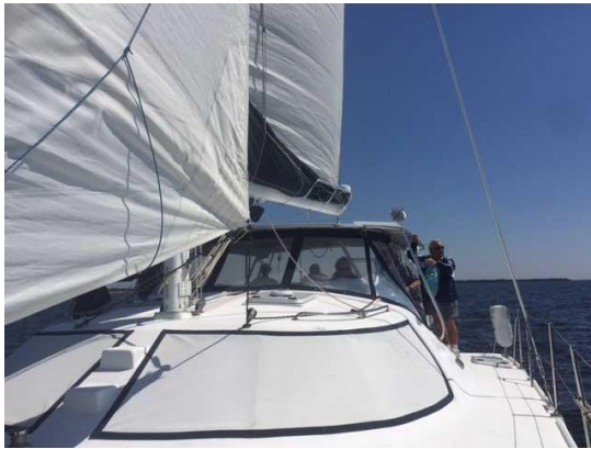
A close up view of Catalyst sailing along

Catalyst is going on the market so we are glad that our members had a chance to experience what we have been providing for our ambassadors.