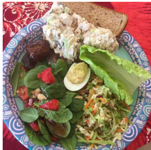
Yummy lunch enjoyed by all

The sail day for our local members was on March 14. It was lucky the date had to be moved as it was a much better day for sailing. It was cool but comfortable for the 2 hour sail for the 16 members that attended. The pot luck ahead of time was delicious. No desserts were brought which tells you that we are all trying to eat a little more light.