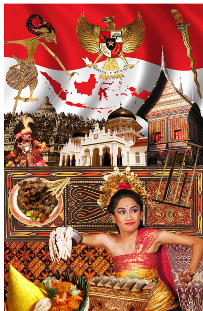
Images of Indonesia

Malang is the second largest city in East Java and is a popular tourist destination. Click on Malang FF to discover more fascinating info about this club of 40 that was founded in 1997 and who has welcomed many FF clubs throughout the world. Banjarmasin is known as a River City because it is located at the junction of the Barito and Martapura Rivers. Its population is 625,000 (2010 census). Find out more by clicking Banjarmasin FF , a club of 27 founded in 2015.