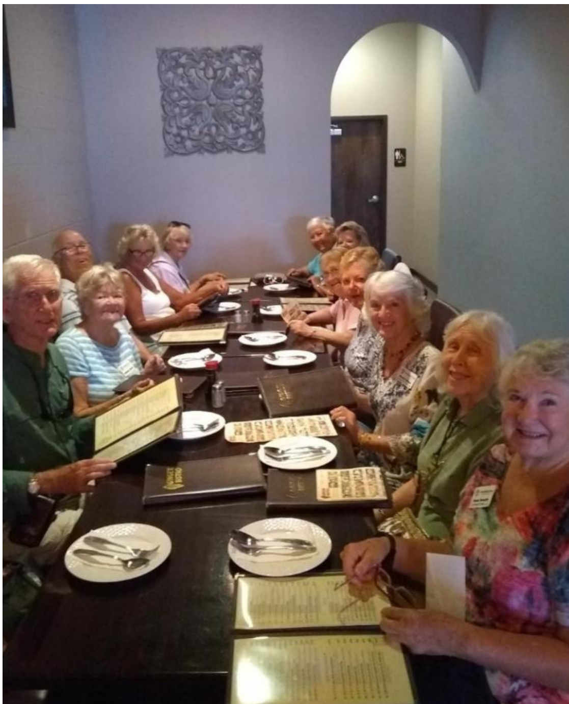
We had a great crowd at the Ginger Bistro Lunch Get-together on June 8!