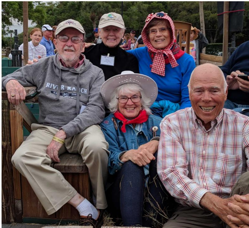
Fun at the Dude Ranch by our club members