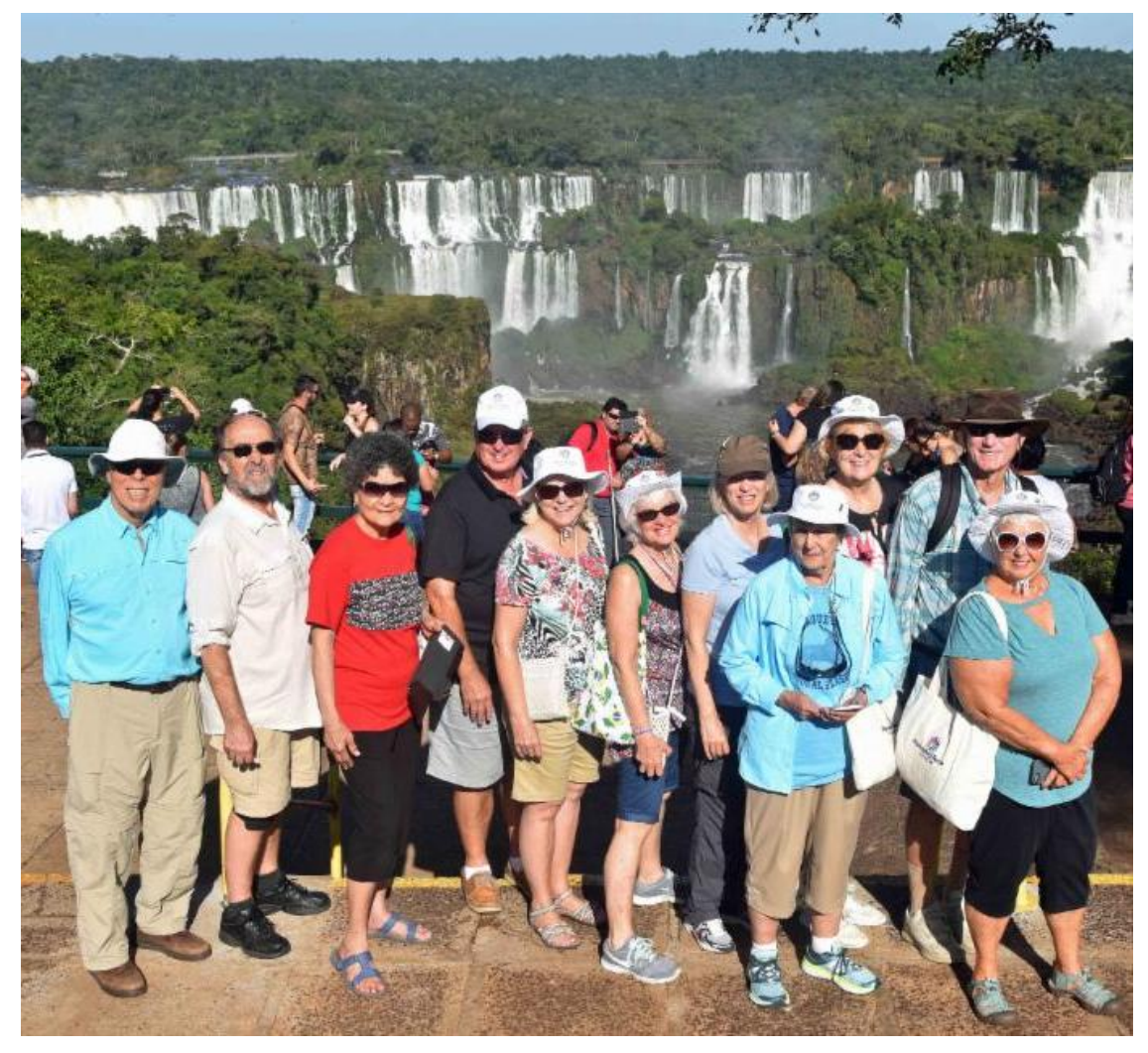
The Happy 11 ambassadors pose before magnificent Iguacu Falls, Brazil side