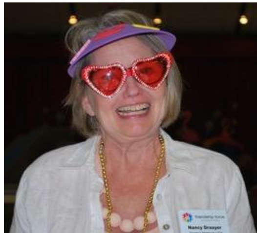
One happy W Michigan ambassador!

The Inbound Journey from West Michigan went off very well. So many of our members stepped up as hosts, dinner hosts, day hosts and committee chairs - some people doing all of the above! Thanks all of you! I think there was much we learned both to continue and to improve on. From the comments we received from the MI ambassadors, they were very happy with the program and activities. We tried some new events e.g. , the tours of Koreshan State Historic Site and Indian Mounds of Bokeelia. We also enjoyed the lunch at Sandy Hook Fish & Rib House in Matlacha and exploring the newly opened Peace River Botanical & Sculpture Garden.