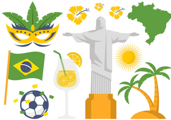
Images of Brazil

Our trip to Brazil is almost here. Thirteen of our members are set for fun, adventures and new friendships with two different clubs. A few more of our members are even doing an additional add on trip with the new club in the Villages.