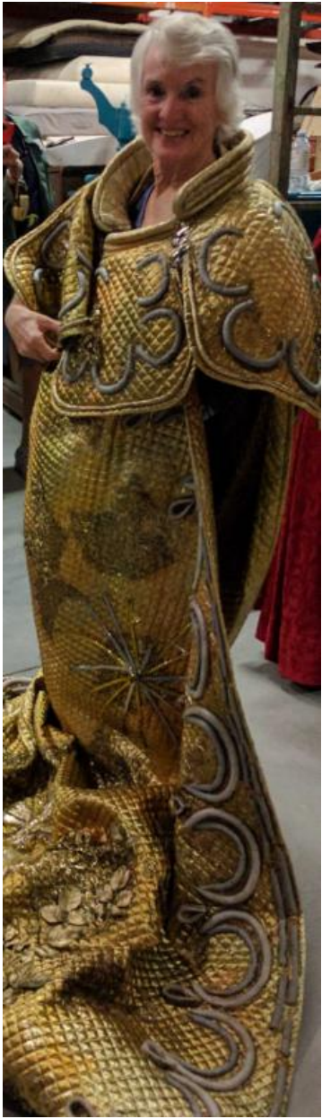
Michelle's gorgeous outfit at Stratford Playhouse, Ontario, Canada