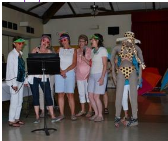
Dottie sings Karaoke with the girls