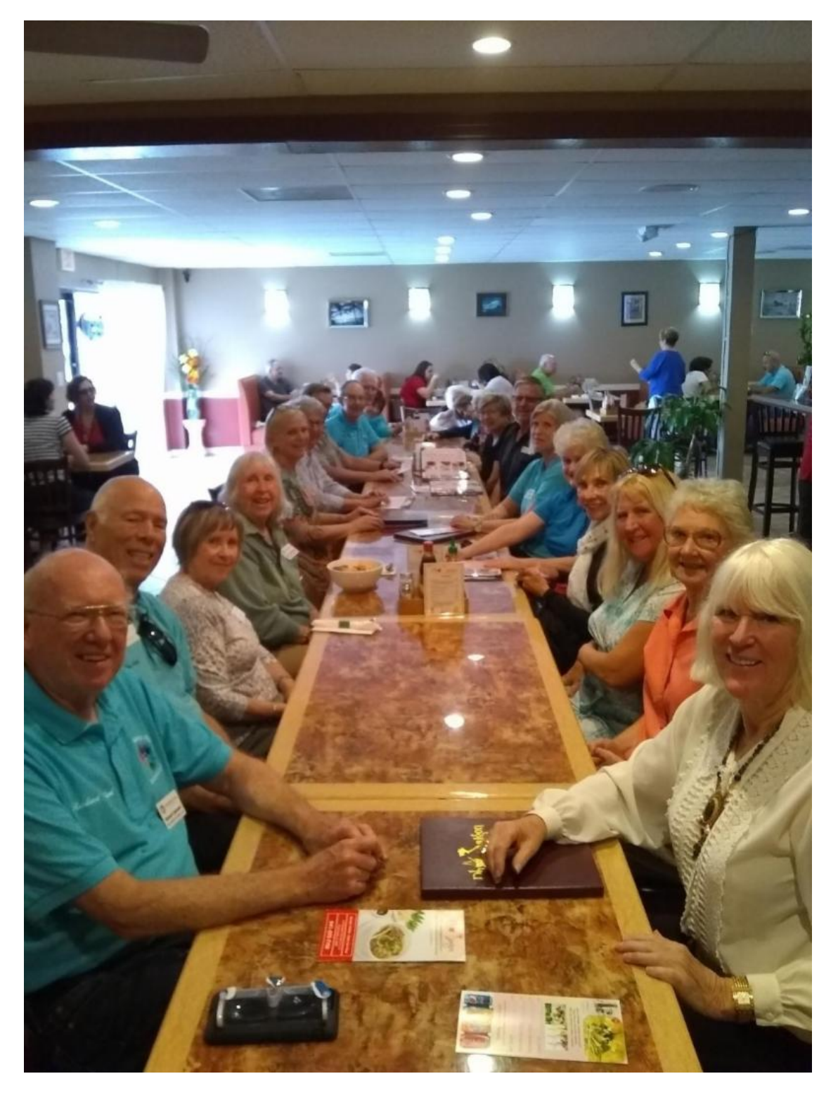
Biggest Group EVER for Vietnamese Food in Punta Gorda following our fabulous February meeting. Yum!