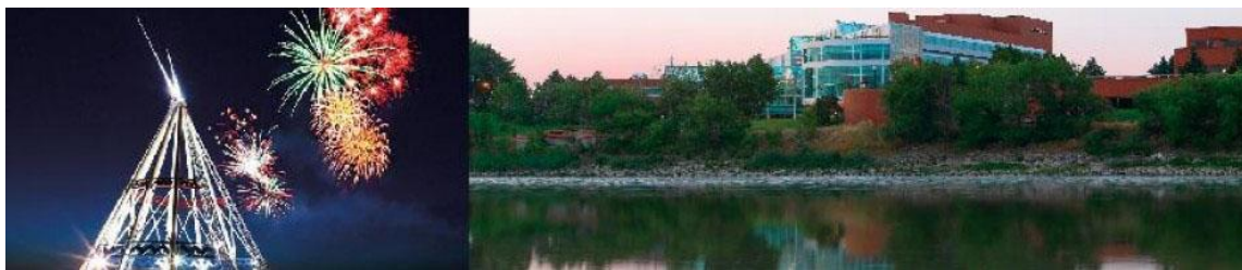
Scenes of Medicine Hat

Our club was assigned to visit two Canadian clubs.