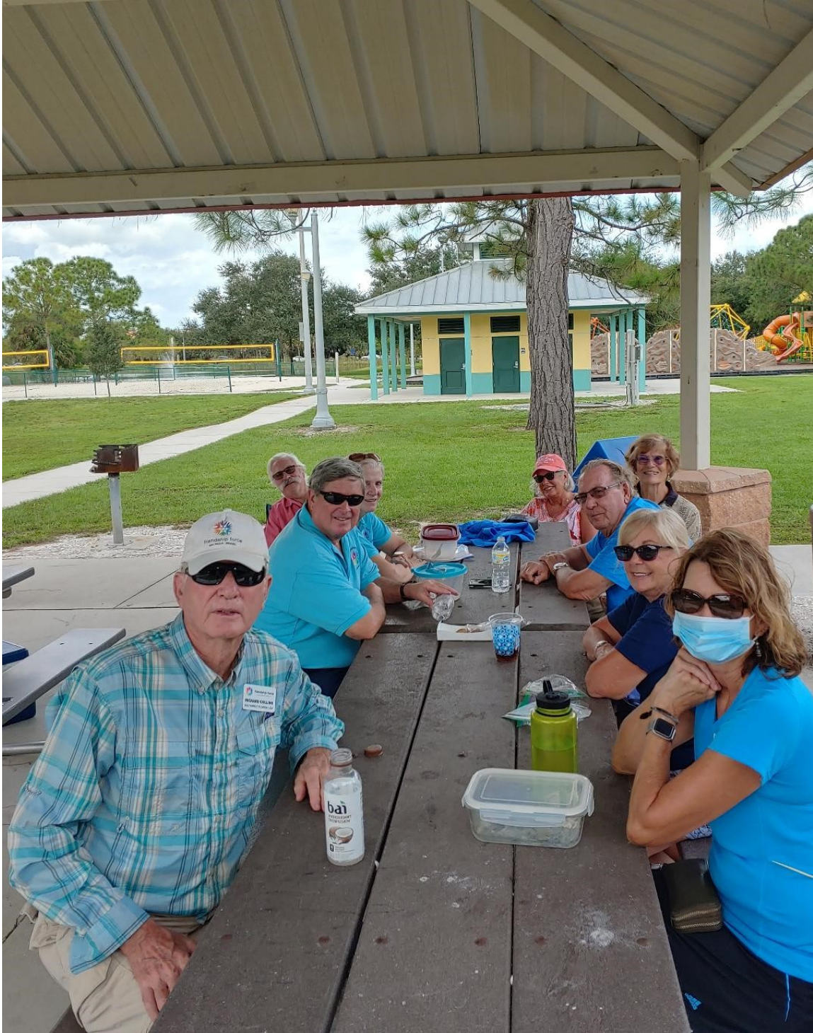
Brown Bag Lunch in the Park Participants