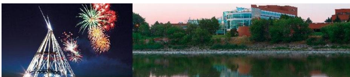
Scenes of Medicine Hat

Our club was assigned to visit two Canadian clubs.