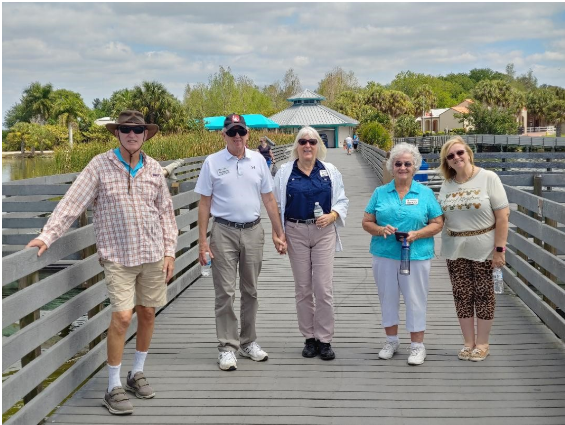
Some of us explored Lakes Park after lunch. This bridge had great views.