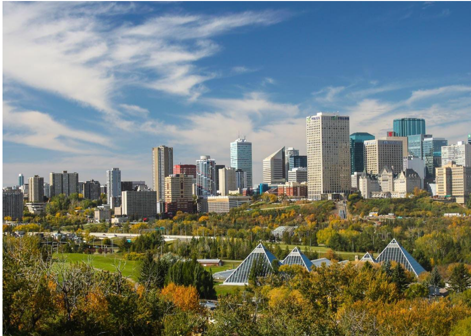
The beautiful cityscape of Edmonton Canada

Zoom with Edmonton Canada Club Tuesday, April 13, 3 pm on your device