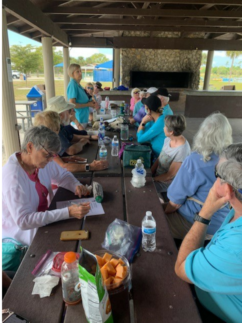
Club members made introductions.