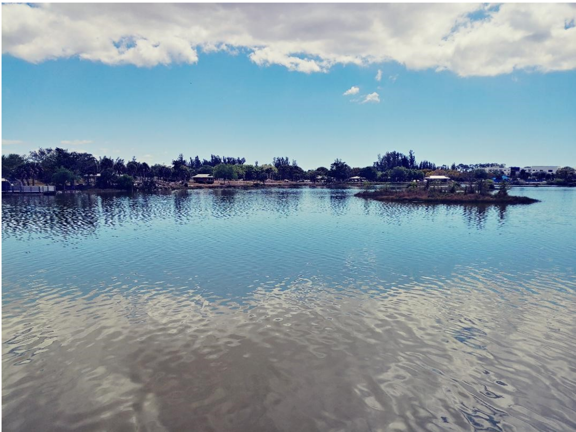
One of the views from the bridge. So pretty!