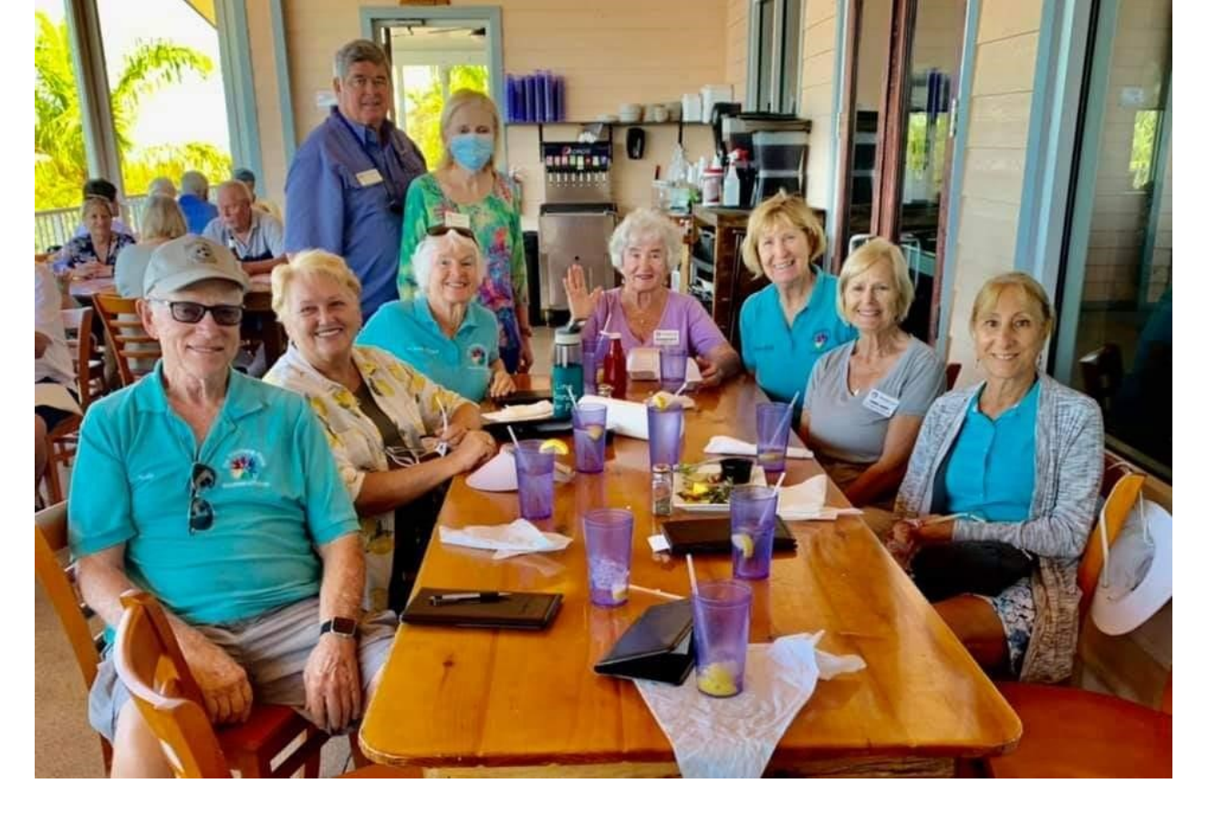
We missed you at the fabulous Mural Walk (if you are not in this picture!) Great lunch Yum!