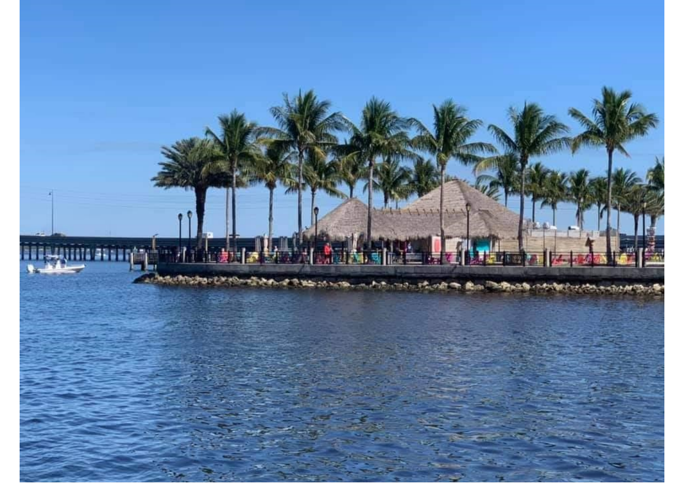
Beautiful walk along Punta Gorda across from the famous Tiki Hut on the Peace River.