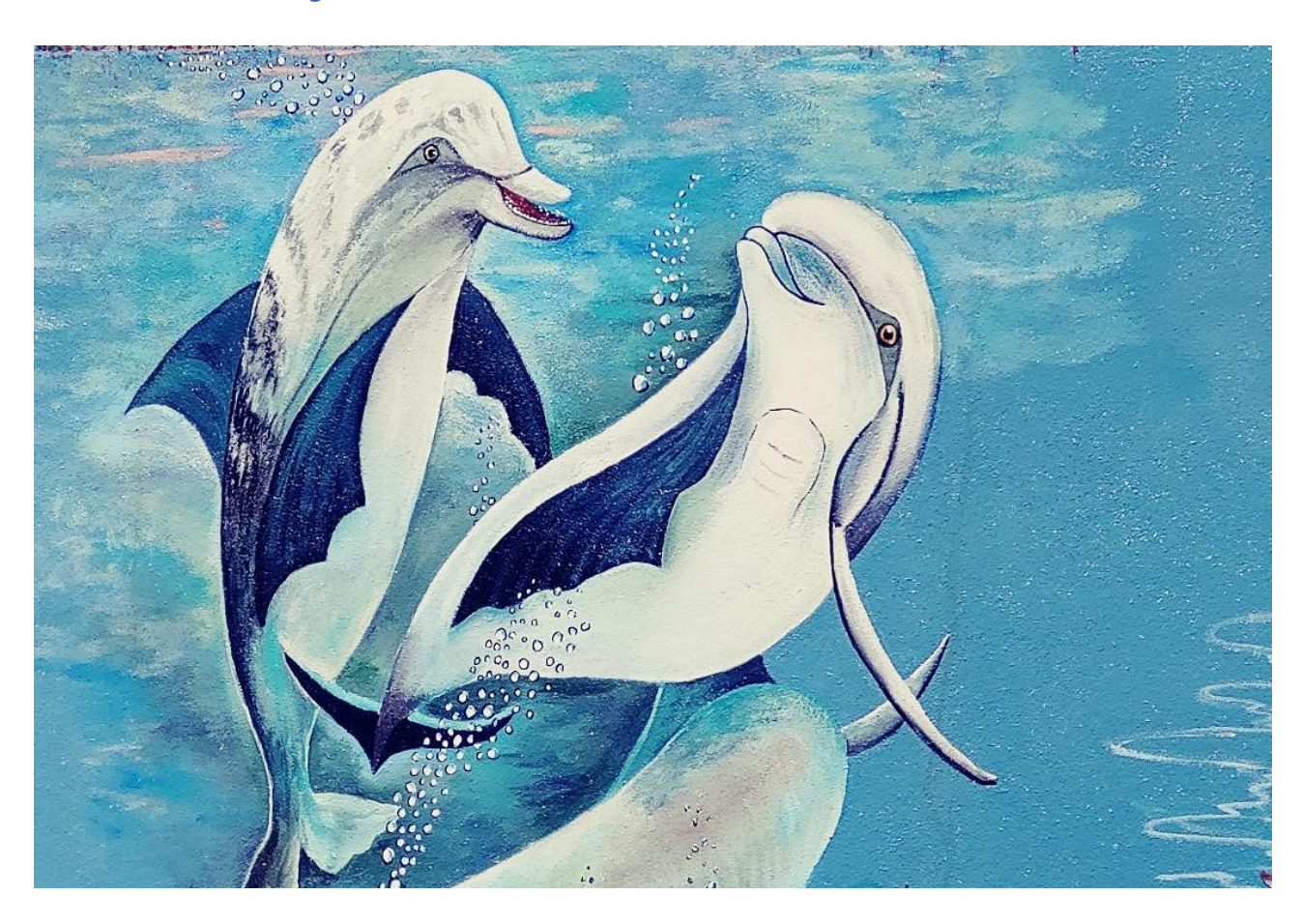
The dolphins in one of the colorful murals along the pathways.