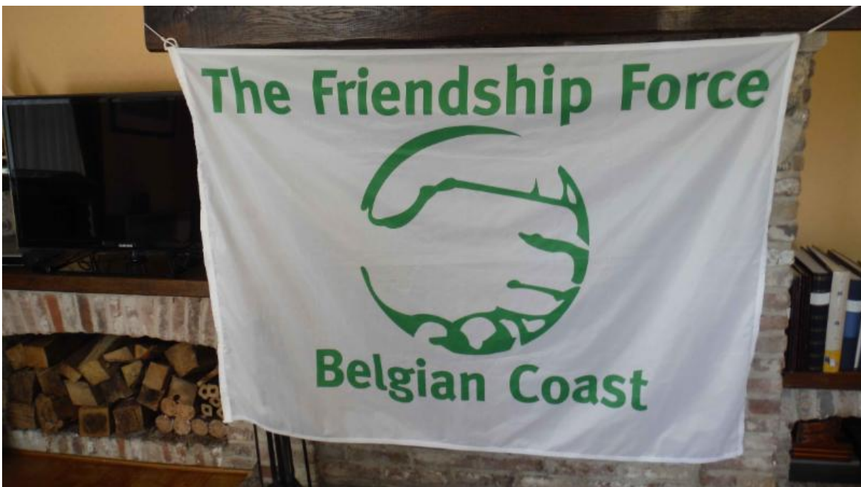
Belgian Coast Club Flag