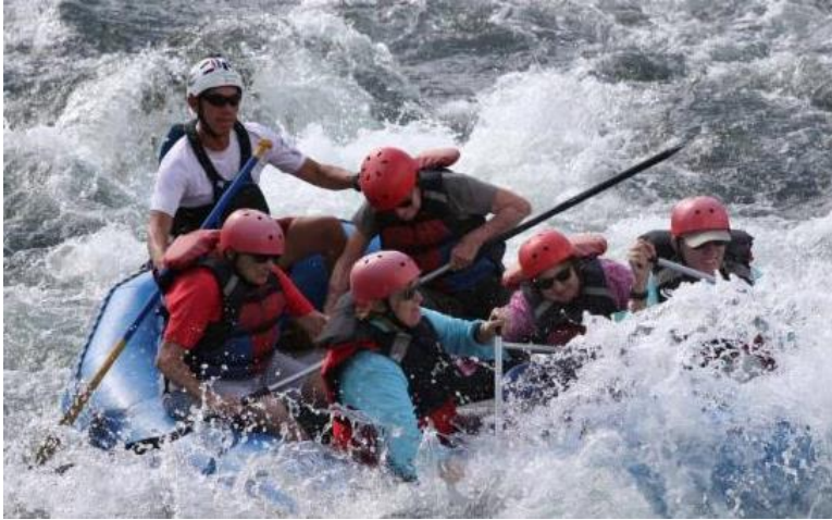
White Water Rafting in Costa Rica