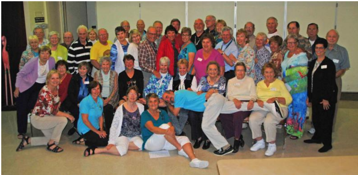
Last Month's Farewell Party with Denver Ambassadors and Our Club

Do you like our newsletter? Oops Forgot again to have the drawing at the last meeting so don't despair! I will put your name in the bowl for last month's newsletter! But, you can have your name in three times if you let me know your comments on this newsletter. Just email me at eagleswingsj@yahoo.com . For those who do so, I will put your name in a bowl and draw for a prize at the June meeting. Winners must be present to win. Hope to hear from you soon!