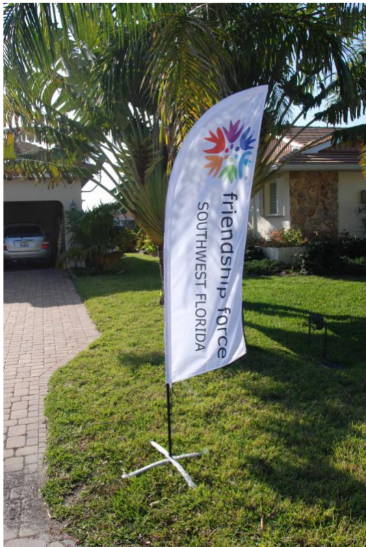
Our new portable feather flag

and I recently addressed a women's group in Naples. We hope to gain a member from that effort.