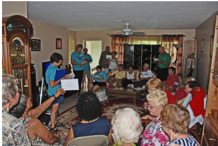
Yemmas host World Friendship Day

Dec 13 - Tentative date for Holiday Party/Brunch, location TBD