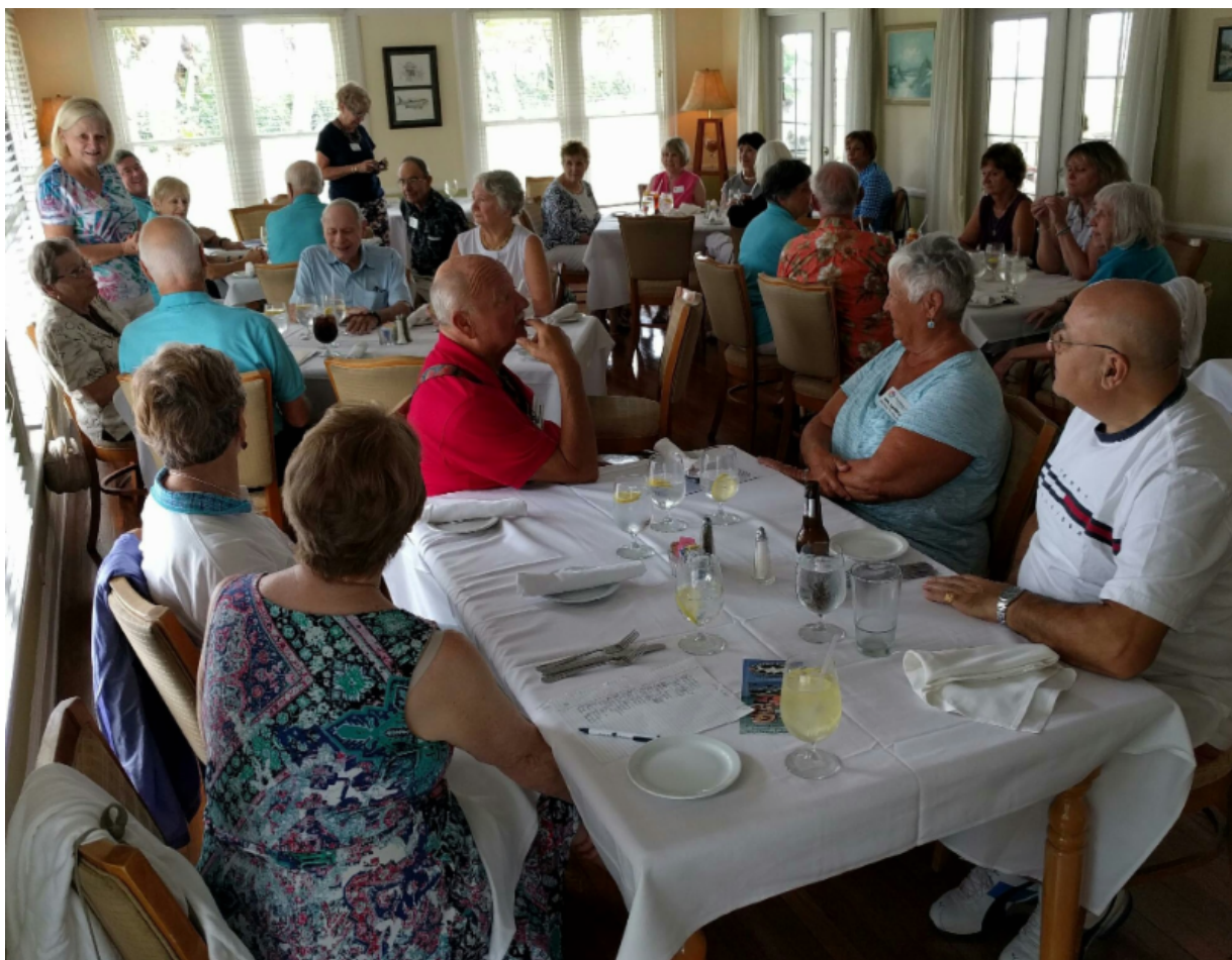
Enjoying lunch together at the Tarpon Lodge