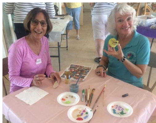
Two FF Presidents do shell crafting