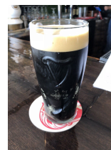
Belgium Monk beer