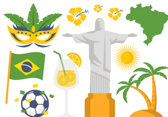
Images of Brazil

Our trip to Brazil is now full. Thirteen of our members are set for fun, adventures and new friendships with two different clubs. A few more of our members are even doing an additional add on trip with the new club in the Villages.