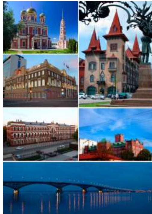
Scenes of City of Saratov, Russia

The city is known as a center of higher education, research and scientific activities. Beside one of the oldest universities in Russia, there are over a dozen colleges in the city. Saratov is an important industrial center of the Volga River area. Its industries are machine-building, oil and chemical. Saratov climate is moderately cold in the winter and it has hot, often dry summers.