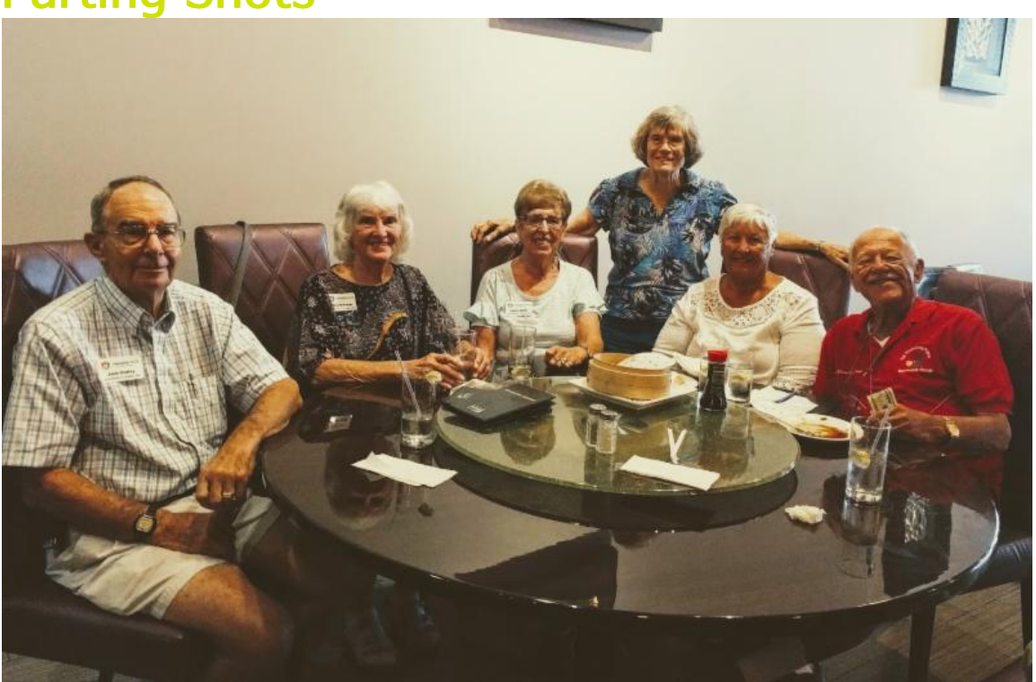
June Lunch at Ginger Bistro was delicious fun!