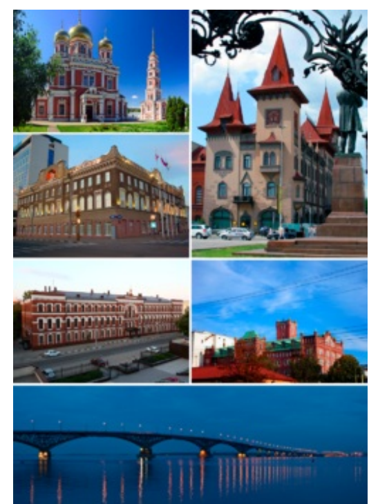
Scenes of City of Saratov, Russia

Saratov is a large city situated in the southeast, the European part of Russia, on the right bank of the Volga River. It is located ~ 520 miles southeast of Moscow. It is an important cultural, economic and educational center of the Volga region. There are 28 members of their Friendship Force Club.