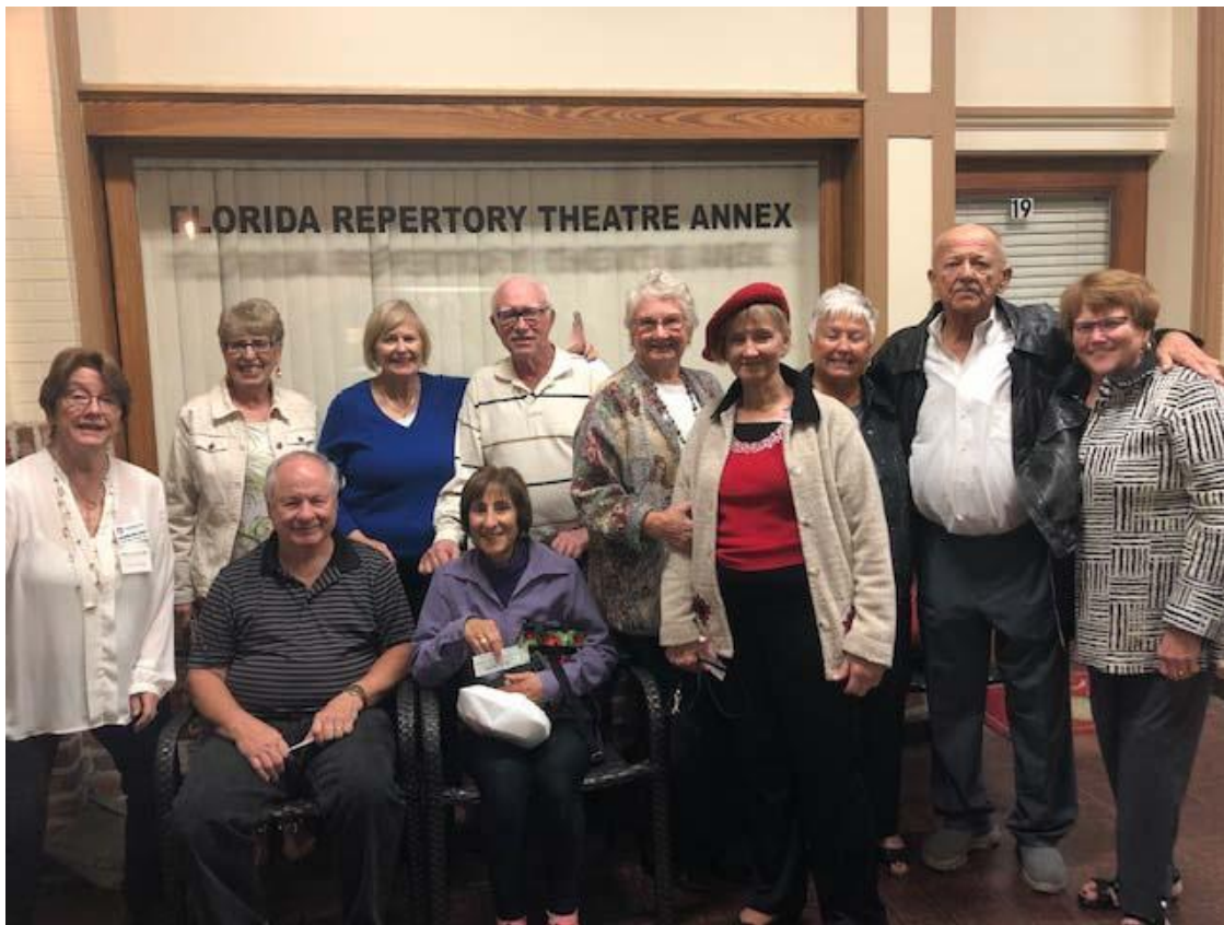
Our members enjoy a Florida Repertory Theatre Performance of the Rosemary Clooney Musical.