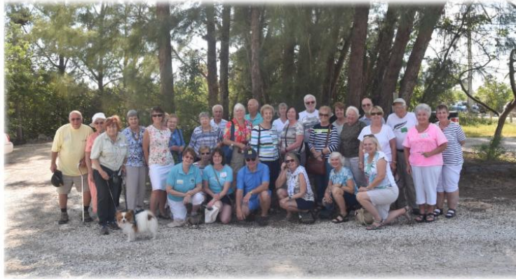
West Michigan Journey to Southwest Florida February 1-7, 2018