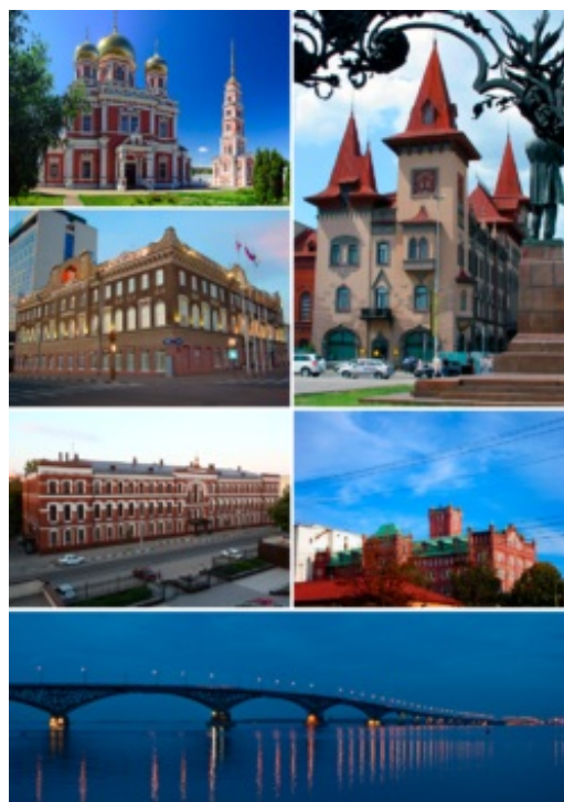
Scenes of City of Saratov, Russia

To refresh your memory, Saratov is a large city situated in the southeast, on the right bank of the Volga River. It is located ~ 520 miles southeast of Moscow. It is an important cultural, economic and educational center of the Volga region.