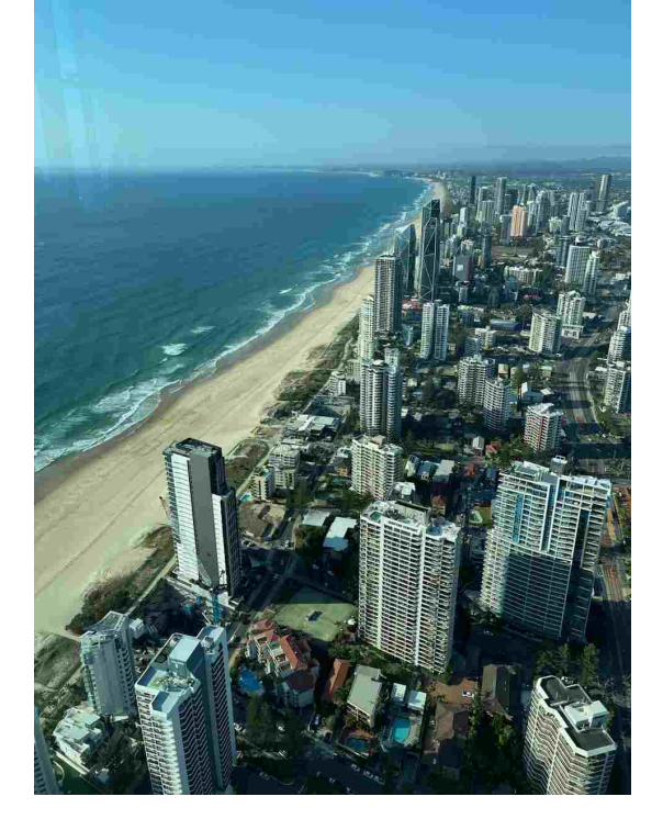
Gold Coast High Rises