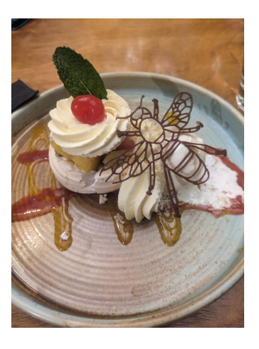
Pavlova is national dessert!