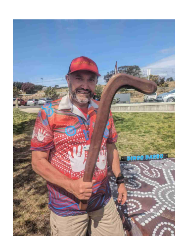
Is that a boomerang?