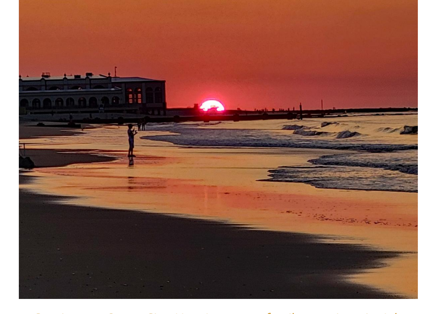
Sunrise over Ocean City, New Jersey - on family vacation trip, July 2023