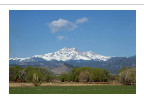
We are visiting FF of Northern Colorado in the summer of 2024!