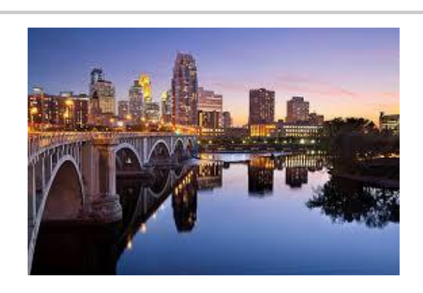
We are both hosting AND visiting Minnesota Twin Cities.

The landscape of the Sherbrooke region, rich in lakes, rivers and mountains is very much an attraction to the local and international tourist. Club members appreciate hosting visitors from other countries or regions. As hosts of ambassadors from the Friendship Force in our household for five to seven days, we share our daily life and our community's attractions. We guide them into exploring our culture and way of life. In addition to participating to the activities organized by our club, our guests may well like to explore the region or the country by themselves. Typically, the club members will organize outings in our town (city hall, mills and dams, murals, museums, etc.) and area (Bombardier's original shop and museum, attractions, mountains, gorges, lakes).