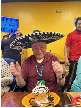
Our ambassador celebrated his birthday in Mexican style