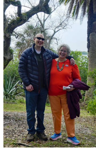
We loved this Mom & Son