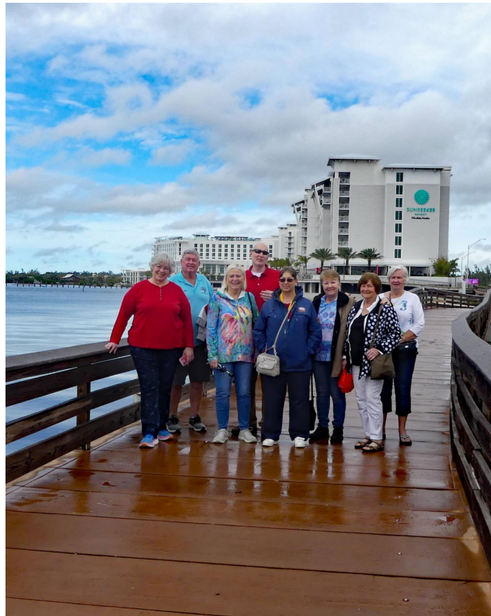
The Kentucky Group toured & lunched at the newly open Sunseeker Resort built by Allegiant.