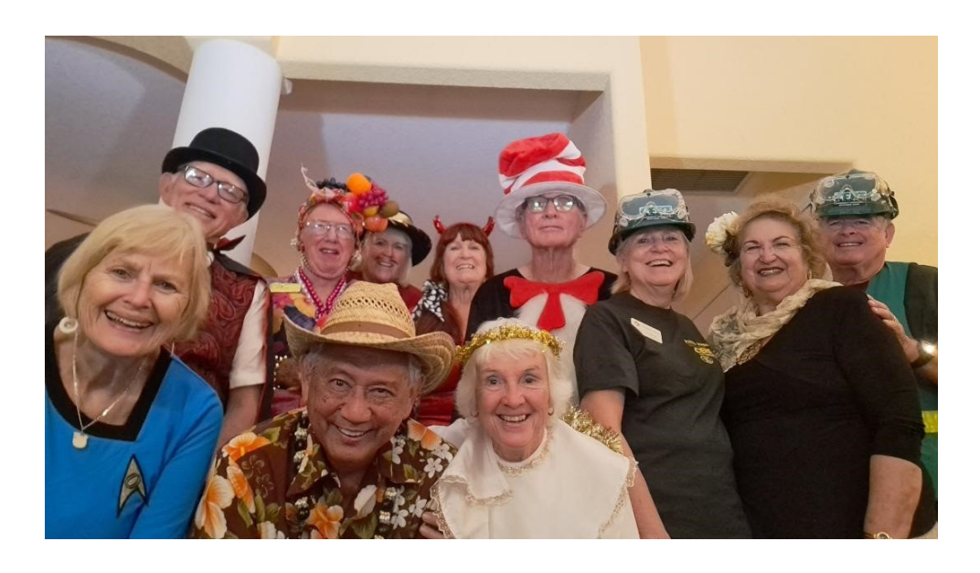
Halloween Selfie with a bunch of strange characters!